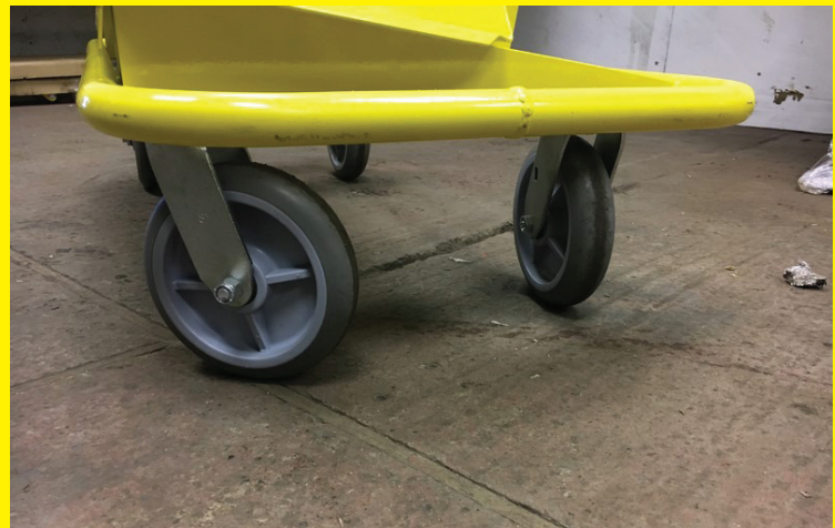
Easy steer wheels for improved manoeuvrability