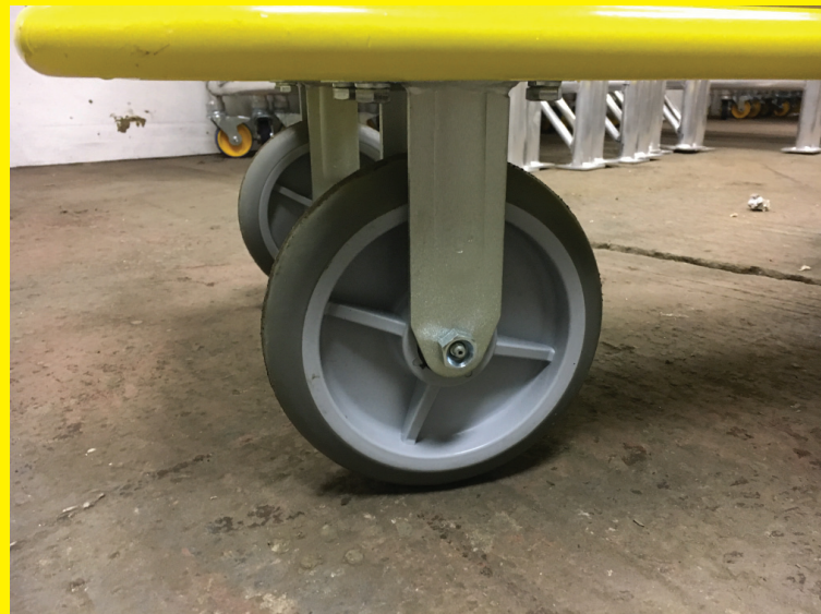
Heavy duty rubber wheels